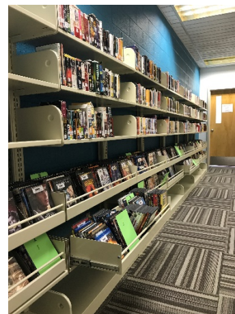
New media shelving with browser boxes

Attached, please find library monthly statistics, fiscal year statistics/graphs, & materials added report.