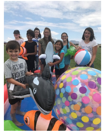
Youth volunteers at Water Fun Day

averages were higher this year. This means that, on average , SRP event attendance increased by 26% and participants read 18% more than last year! Thank you SRP participants, parents, sponsors, and volunteers for another successful program!