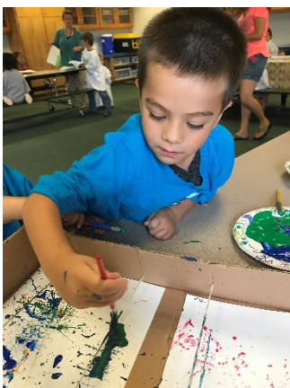
This participant is making "action art" during outreach with a local preschool

The library has received lots of meaningful feedback from the public regarding the new location. Most patrons are in awe of the increased square footage and potential for collection expansion, expressing how beautiful the new space is. Other observations point out possible safety hazards and/or shortcomings, offering additional insight on what needs to be improved upon to better serve the public. Although the list is long, the Town and the Moriarty-Edgewood School District are aware of the issues and are actively collaborating on solutions. Some issues have already been addressed; thank you for the helpful feedback, Edgewood!