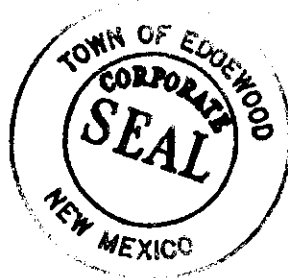
Mayor Robert Stearly