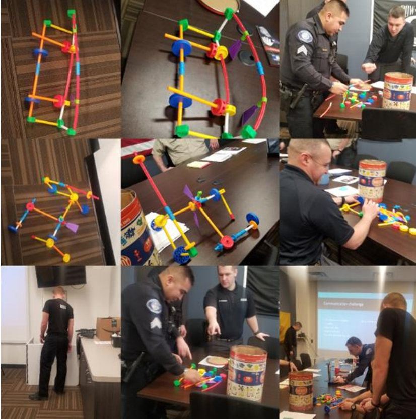
February Staff Meeting team building exercise.

4. The Next Citizen's Police Academy will begin in April.