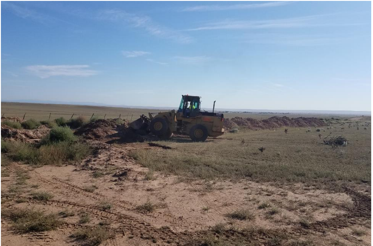
c) See the attached photo showing that the additional ponding areas have been dewatered and are in the process of being backfilled and regraded.